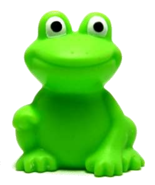
Proverbs 20:3 Avoiding a fight is a mark of honor; only fools insist on quarreling.